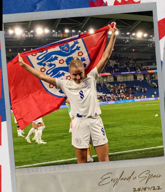
England v Spain 20/07/22