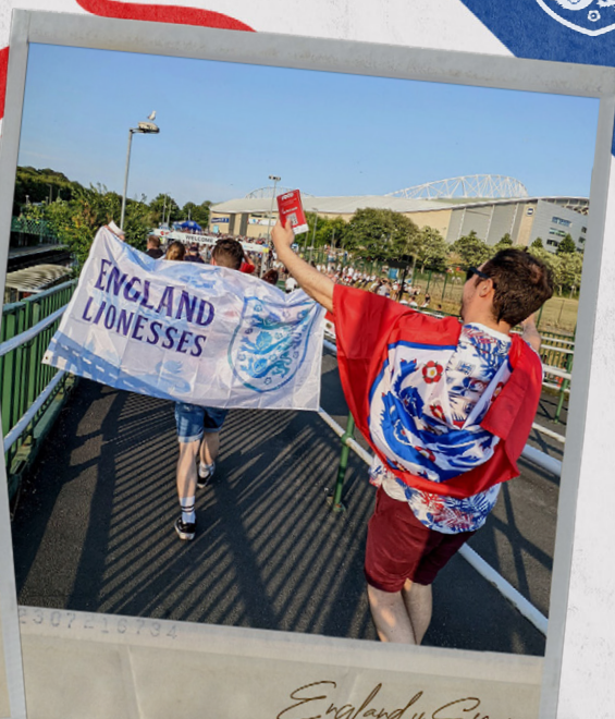
England v Spain